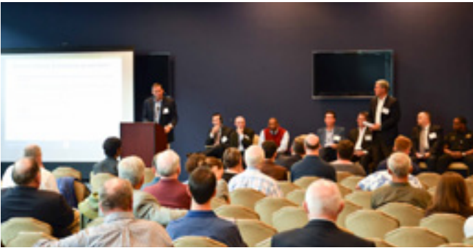
The project team discussed the EIS shift and retained project concepts at the May 21 public meeting