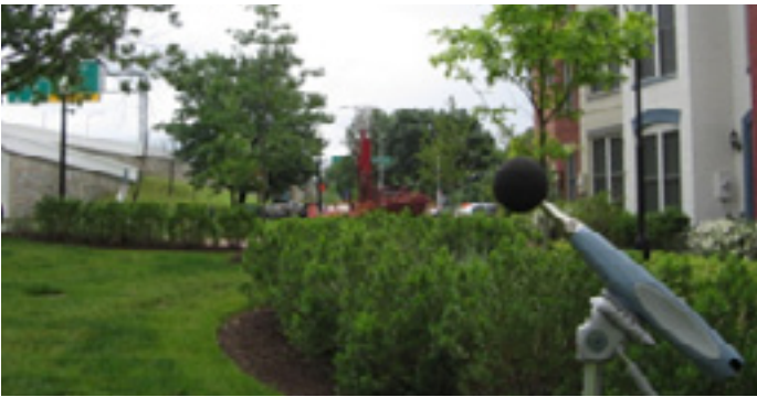
Sound level meters in operation along Virginia Avenue

Noise measurements were conducted over six full days between May 22 and June 22, 2012. Sound level meters were set up at various locations along Virginia Avenue SE: Capitol Quarter, Arthur Capper Senior Center, Marine Corps Recreation Facility, Virginia Avenue Park and the eastern tunnel portal. The noise measurements are being reviewed and will be used as the basis to predict future noise levels in the areas surrounding the Virginia Avenue Tunnel Project.