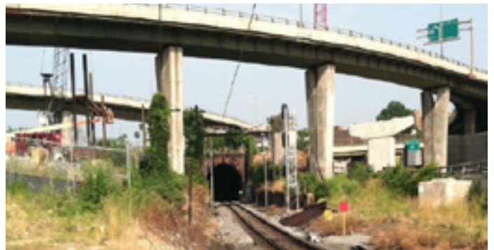
A view of the east portal of the Tunnel

Owned and maintained by CSX, the Virginia Avenue Tunnel is located in Southeast Washington, DC, beneath the eastbound lanes side of Virginia Avenue SE. By reconstructing Virginia Avenue Tunnel with a vertical height that will allow CSX to operate double-stack intermodal container freight trains, the railroad will be able to expand its capacity to transport freight in an environmentally sensitive manner. Furthermore, because the new tunnel will re-establish a second set of tracks, CSX will eliminate the chokepoint that currently delays all trains traveling through the Washington region.