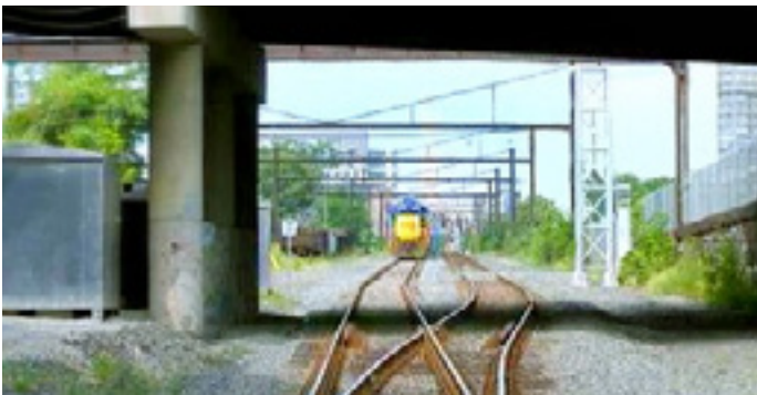
Looking west from the Virginia Avenue Tunnel portal near Garfield Park