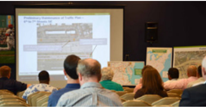
The project team took questions and answers from the audience on issues surrounding the project